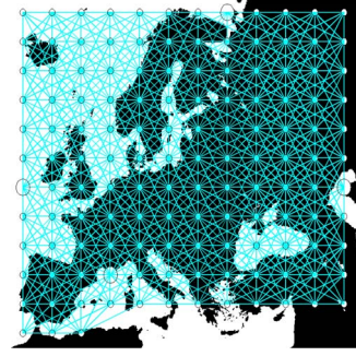
Fig. 2. Deployment and connectivity of 135 stations over the European continent (from top to down, \mathcal{A}_8 , \mathcal{A}_{73} , \mathcal{A}_{84} , and \mathcal{A}_{112} are represented with bigger circles).

It is straightforward to verify that the state X^* = \mathbf{1}_n(I^*, V^*) is an equilibrium for the above SVBDS. While the system is not globally convergent to X^* , it is possible to show that such an equilibrium is attractive in a region that is large enough to tolerate up to \gamma incorrect land detections. Let us consider the general case in which three assumptions hold: 1) I^* \neq \emptyset and